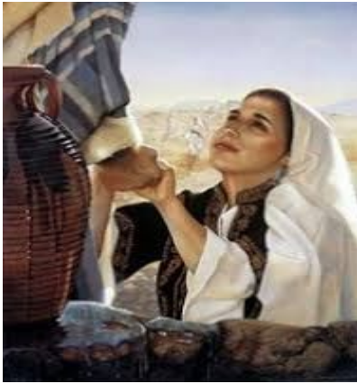
Twentieth Sunday in Ordinary Time Year A 19th/20th August 2023