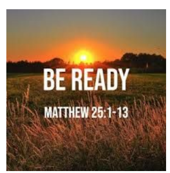
Thirty Second Sunday in Ordinary Time Year A 11th/12th November 2023