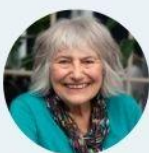
Anne Ring "Engaging with Ageing" What matters as we grow older

St Brigid's Parish Hall, 135 Brook Street, Coogee 8.30 am for 9.15 am Panel Discussion